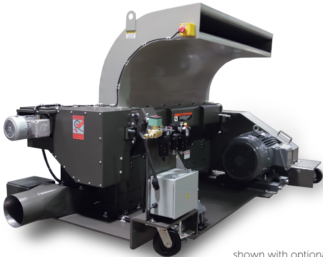
shown with optional infeed chute